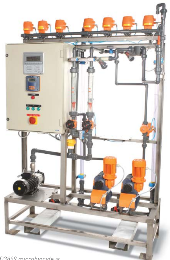
The Spectrum XD3899 microbiocide is produced onsite using patented dosing equipment.