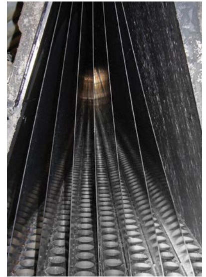
Headbox treated with a competitive biocide after eight weeks (left) and same headbox treated with the Spectrum XD3899 microbiocide after eight weeks (right).

to other oxidizers and do so at an economical cost. In fact, gains in production and sheet quality can often be achieved at a cost equal to or less than your existing microbiological control program.