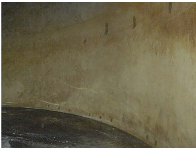
With the Biobond Program: whitewater chest walls clean, no deposition