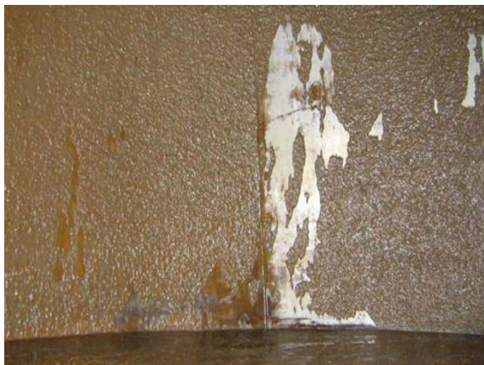
Without the Biobond Program: walls of whitewater chest show high levels of deposition

Now, with Solenis' introduction of the Biobond program, the game has changed completely. This patented approach ensures that the majority of incoming starch is preserved, reused, and recycled, leaving the paper mill as it should— with the paper. This valuable raw material can now be reused, significantly reducing input costs in paper production. Further, all of the negatives associated with dissolved starch in the system are eliminated, improving productivity and paper quality, and reducing overall costs.