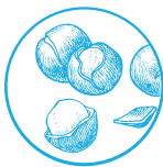
Good Sense Shea & Sandalwood A rich blend of sweetness and delicate wood scent