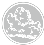
Good Sense Fresh Fresh Linen Fragrance