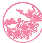
Good Sense Cherry Blossom A blend of fruits and berries embodied in blossoming garden