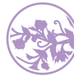
Good Sense Floral Aromatic floral fragrance of fresh sweet pea flower bouquet