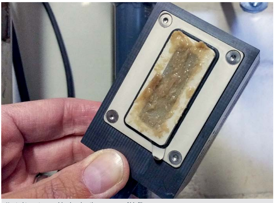
Heated target assembly showing the presence of biofilm

A speciality chemicals company in southern Europe operates a