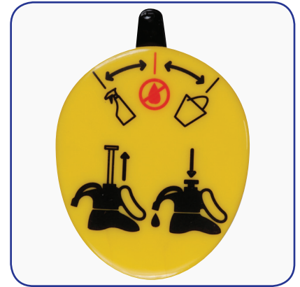
Control knob with easy-to-understand icons.