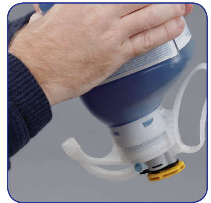
Patented Spill-Tite sonically-welded head eliminates leaking of concentrate.